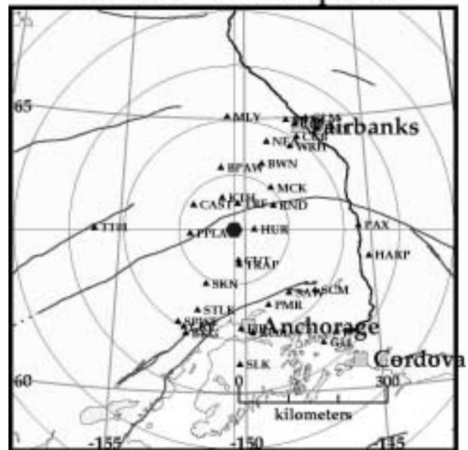
Circles are 111 km (70 miles) apart.

The location and magnitude for this earthquake may be updated as data from additional seismic stations are received. The Alaska Earthquake Information Center will continue to gather data and may issue additional releases as appropriate. With any moderate or large earthquake, aftershocks should be expected to occur.