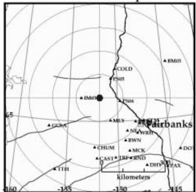
Circles are 111 km (70 miles) apart.

The location and magnitude for this earthquake may be updated as data from additional seismic stations are received. The Alaska Earthquake Information Center will continue to gather data and may issue additional releases as appropriate. With any moderate or large earthquake, aftershocks should be expected to occur.