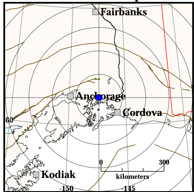
Circles are 111 km (70 miles) apart.

The location and magnitude for this earthquake may be updated as data from additional seismic stations are received. The Alaska Earthquake Information Center will continue to gather data and may issue additional releases as appropriate. With any moderate or large earthquake, aftershocks should be expected to occur.