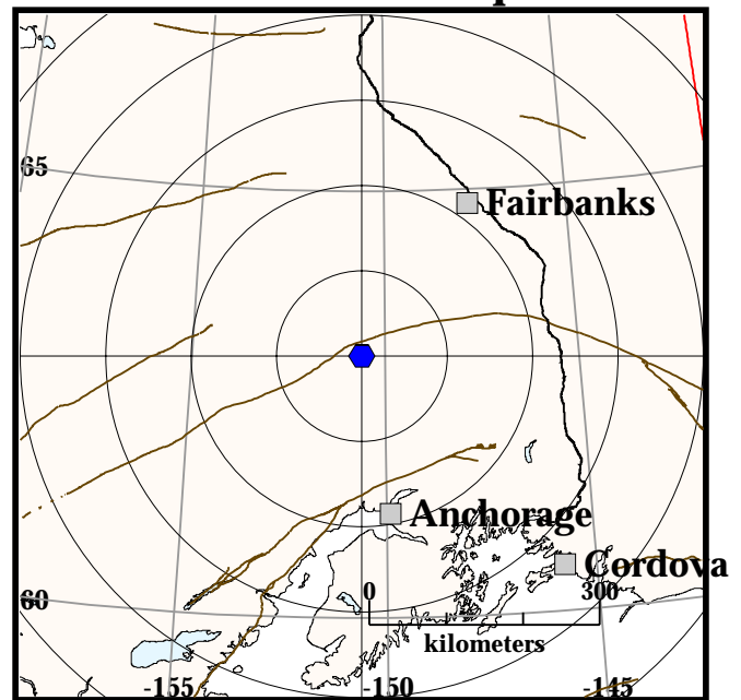
Circles are 111 km (70 miles) apart.

The location and magnitude for this earthquake may be updated as data from additional seismic stations are received. The Alaska Earthquake Information Center will continue to gather data and may issue additional releases as appropriate. With any moderate or large earthquake, aftershocks should be expected to occur.