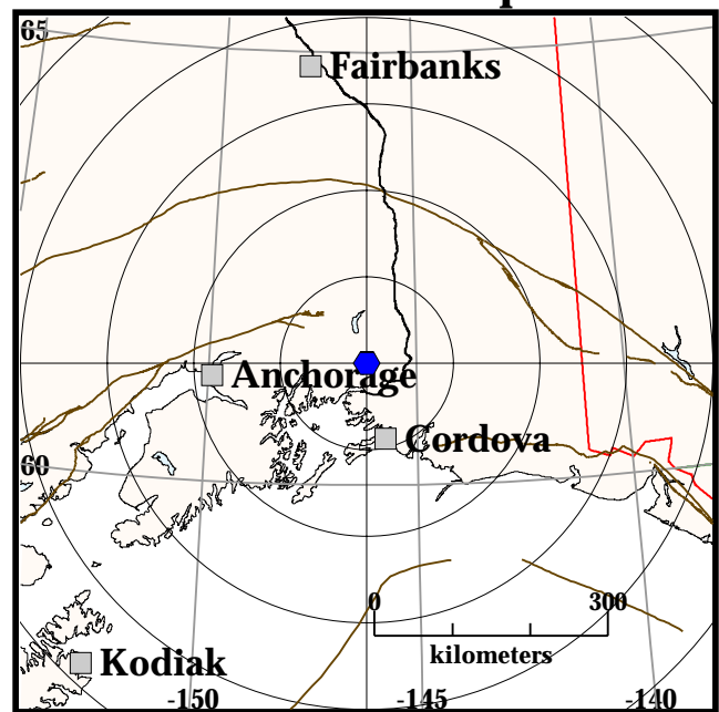
Circles are 111 km (70 miles) apart.

The location and magnitude for this earthquake may be updated as data from additional seismic stations are received. The Alaska Earthquake Information Center will continue to gather data and may issue additional releases as appropriate. With any moderate or large earthquake, aftershocks should be expected to occur.