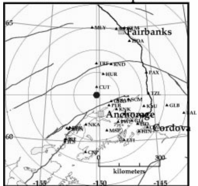
Circles are 111 km (70 miles) apart.

The location and magnitude for this earthquake may be updated as data from additional seismic stations are received. The Alaska Earthquake Information Center will continue to gather data and may issue additional releases as appropriate. With any moderate or large earthquake, aftershocks should be expected to occur.