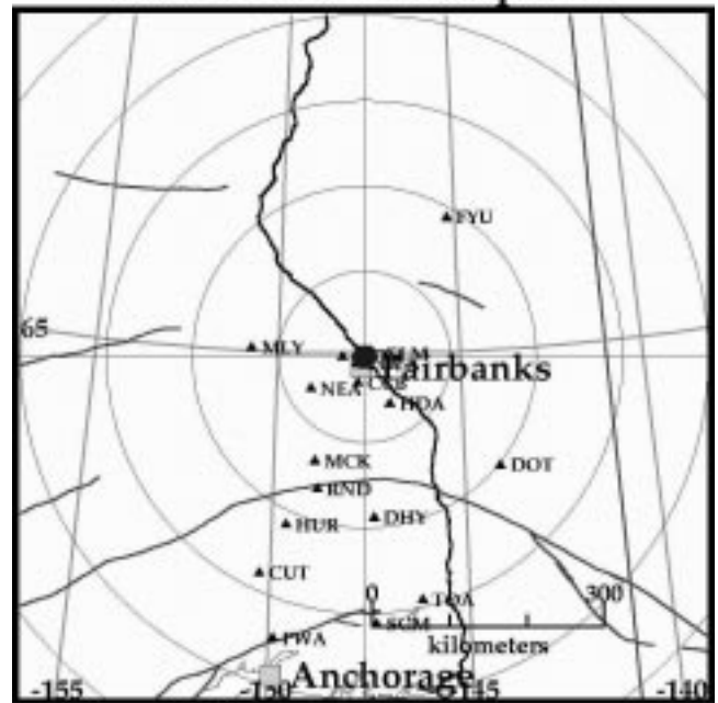
Circles are 111 km (70 miles) apart.

The location and magnitude for this earthquake may be updated as data from additional seismic stations are received. The Alaska Earthquake Information Center will continue to gather data and may issue additional releases as appropriate. With any moderate or large earthquake, aftershocks should be expected to occur.