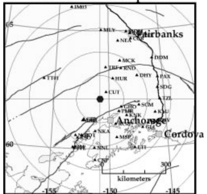
Circles are 111 km (70 miles) apart.

The location and magnitude for this earthquake may be updated as data from additional seismic stations are received. The Alaska Earthquake Information Center will continue to gather data and may issue additional releases as appropriate. With any moderate or large earthquake, aftershocks should be expected to occur.