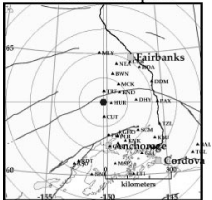
Circles are 111 km (70 miles) apart.

The location and magnitude for this earthquake may be updated as data from additional seismic stations are received. The Alaska Earthquake Information Center will continue to gather data and may issue additional releases as appropriate. With any moderate or large earthquake, aftershocks should be expected to occur.