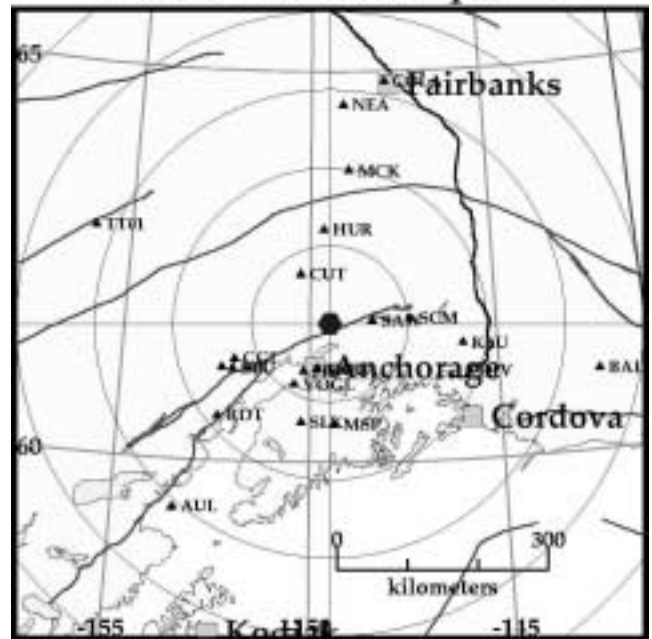
Circles are 111 km (70 miles) apart.

The location and magnitude for this earthquake may be updated as data from additional seismic stations are received. The Alaska Earthquake Information Center will continue to gather data and may issue additional releases as appropriate. With any moderate or large earthquake, aftershocks should be expected to occur.