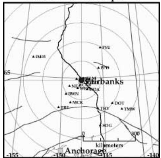
Circles are 111 km (70 miles) apart.

The location and magnitude for this earthquake may be updated as data from additional seismic stations are received. The Alaska Earthquake Information Center will continue to gather data and may issue additional releases as appropriate. With any moderate or large earthquake, aftershocks should be expected to occur.