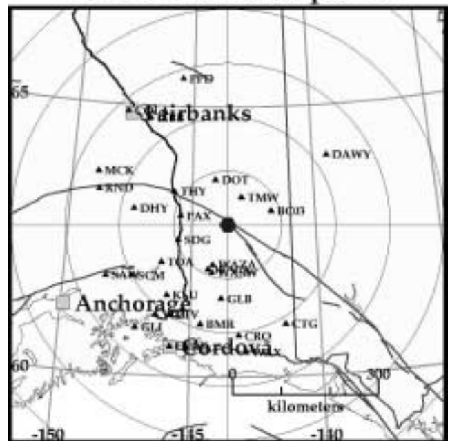
Circles are 111 km (70 miles) apart.

The location and magnitude for this earthquake may be updated as data from additional seismic stations are received. The Alaska Earthquake Information Center will continue to gather data and may issue additional releases as appropriate. With any moderate or large earthquake, aftershocks should be expected to occur.