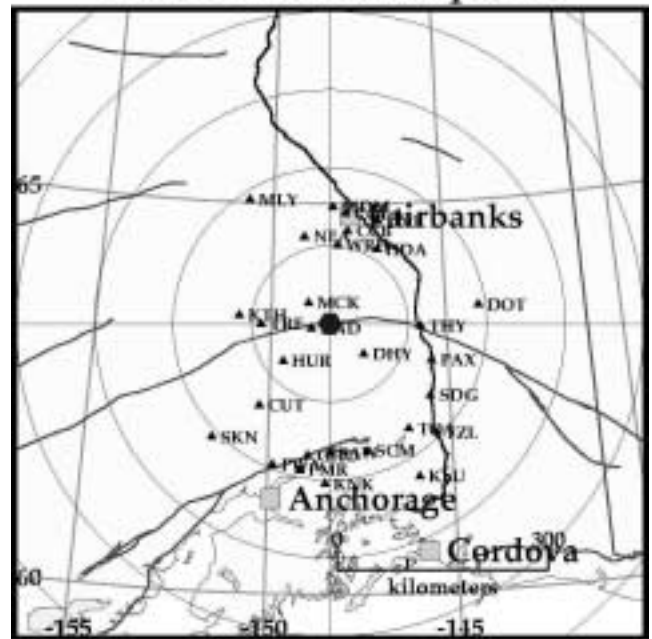
Circles are 111 km (70 miles) apart.

The location and magnitude for this earthquake may be updated as data from additional seismic stations are received. The Alaska Earthquake Information Center will continue to gather data and may issue additional releases as appropriate. With any moderate or large earthquake, aftershocks should be expected to occur.