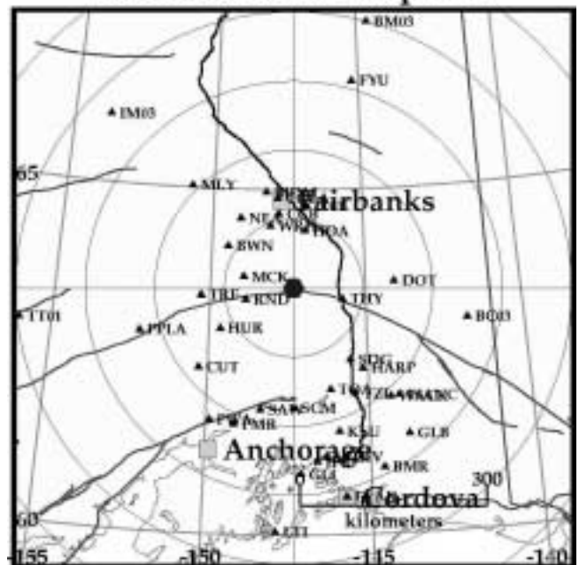
Circles are 111 km (70 miles) apart.

The location and magnitude for this earthquake may be updated as data from additional seismic stations are received. The Alaska Earthquake Information Center will continue to gather data and may issue additional releases as appropriate. With any moderate or large earthquake, aftershocks should be expected to occur.