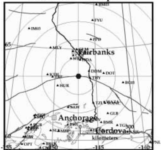
Circles are 111 km (70 miles) apart.

The location and magnitude for this earthquake may be updated as data from additional seismic stations are received. The Alaska Earthquake Information Center will continue to gather data and may issue additional releases as appropriate. With any moderate or large earthquake, aftershocks should be expected to occur.