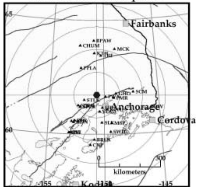
Circles are 111 km (70 miles) apart.

The location and magnitude for this earthquake may be updated as data from additional seismic stations are received. The Alaska Earthquake Information Center will continue to gather data and may issue additional releases as appropriate. With any moderate or large earthquake, aftershocks should be expected to occur.