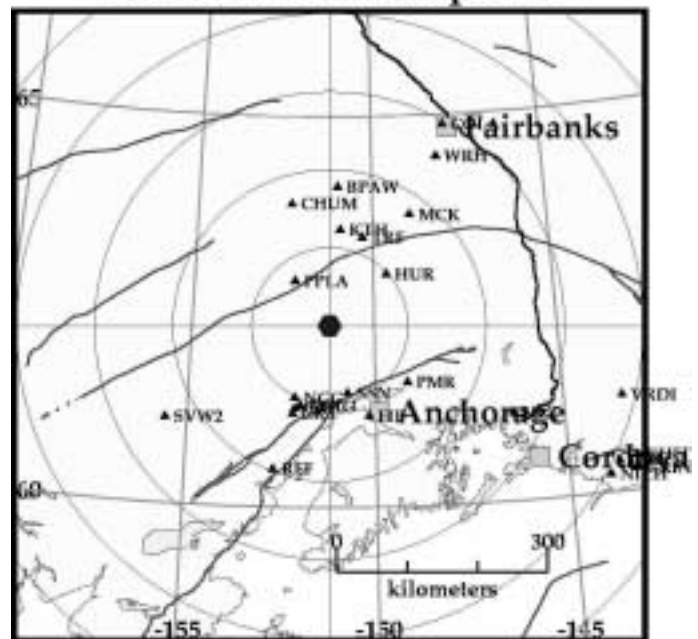
Circles are 111 km (70 miles) apart.

The location and magnitude for this earthquake may be updated as data from additional seismic stations are received. The Alaska Earthquake Information Center will continue to gather data and may issue additional releases as appropriate. With any moderate or large earthquake, aftershocks should be expected to occur.