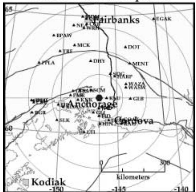
Circles are 111 km (70 miles) apart.

The location and magnitude for this earthquake may be updated as data from additional seismic stations are received. The Alaska Earthquake Information Center will continue to gather data and may issue additional releases as appropriate. With any moderate or large earthquake, aftershocks should be expected to occur.